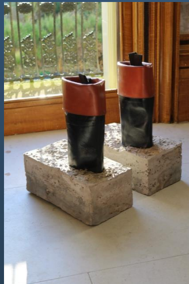
A. Ash 'To make concrete', Regency Town House Gallery (2024)