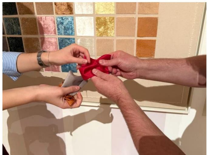
Participants using the sensory inclusion resource created for the Yto Barrada Thrill, Fill and Spill exhibition at South London Gallery.